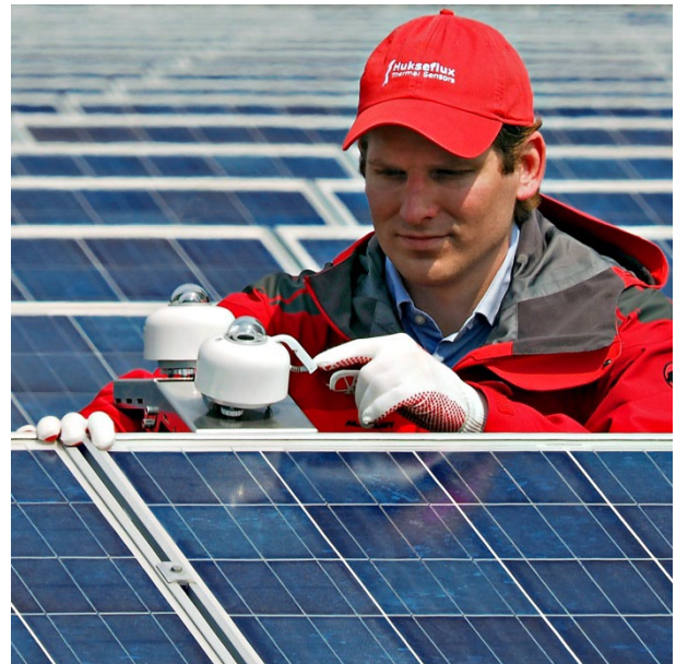
Figure 3 two SR30 secondary standard pyranometers with digital output for GHI (global horizontal irradiance) and POA (plane of array) measurement applications

Recirculating ventilation is as effective in suppressing dew and frost deposition at 2 W as traditional ventilation is at 10 W. RVH™ technology also leads to a reduction of zero offsets.