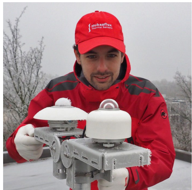
Figure 1 frost and dew deposition: clear difference between a non-heated pyranometer (back) and SR30 with RVH™ - Recirculating Ventilation and Heating - technology (front)

IEC 61724-1:2017 requires pyranometer heating and ventilation for class A, and heating only for class B. Why? Pyranometer domes are made of glass. When facing the sky on a clear night, glass temperature tends to go below dewpoint, so that water condenses on the dome. Heating and ventilation of solar radiation sensors keeps the glass temperature above dewpoint and free from dew and frost deposition. This significantly increases the reliability of the measured data.