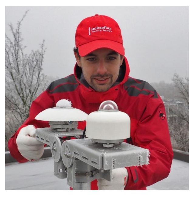
Figure 1 A typical problem in freezing conditions: ice accumulation on the pyranometer dome surface reduces data availability. At the front, a new pyranometer design with recirculating ventilation.

• when using Hukseflux model SR25: this model may be heated without using ventilation, still having low zero offsets.