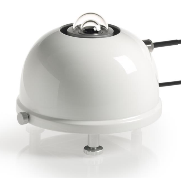
Figure 3 Traditional external VU01 ventilation unit with pyranometer SR20

Figure 2 Data availability in cold climates is negatively impacted by various factors. In this example, we examine a single rime event on a clear sky day in the Netherlands. SR30 is compared to two traditional pyranometers: one is unventilated and unheated while the other is externally ventilated and heated. On such a clear sky day, one expects a cosine-like curve such as the SR30 shows. Although the deviation of the unventilated pyranometer curve might be filtered out by data quality control, the deviation of the ventilated pyranometer curve can not be filtered out reliably, contaminating the data without you even knowing. Data taken on 4 DEC 2016, courtesy of KNMI.