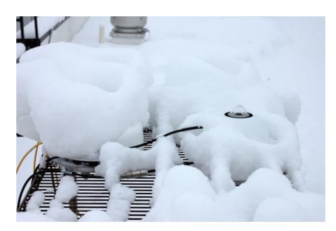
Figure 5 Does ventilation work to remove snow? Not reliably: this photo shows 3 ventilation units in FEB 2014 in Logan UT, USA powder snow. Only 1 of the 3 pyranometers, the one at the right (SR20 with VU01), is visible. The other 2 are still covered in snow.

Maintenance schedule as described in chapter 6, recommends instrument cleaning as well as checks of the ventilator once per day, lubrication or cleaning of ventilators every year.