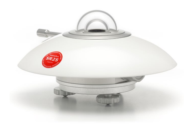
Figure 2 Example of a Hukseflux pyranometer: SR25 secondary standard pyranometer with sapphire outer dome. This model is recommended for research grade diffuse radiation measurement. Output is either analogue millivolt or digital via Modbus RTU over RS-485 and analogue 4-20 mA (current loop).