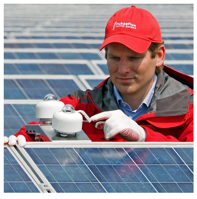
Figure 1 SR30 pyranometers, our most popular solution for PV system performance monitoring according to IEC 61724-1 class A

Hukseflux offers a wide range of solutions for measurement of solar radiation. This brochure offers you general guidelines for selection of the right instrument. The application of pyranometers in PV system performance monitoring according to IEC 61724-1 is highlighted as an example. Sensors specific for diffuse radiation and meteorological networks are also addressed in this selection guide.