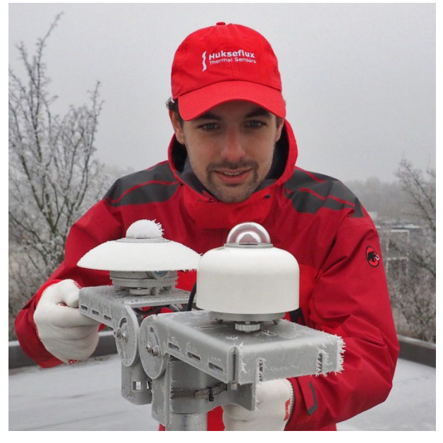
Figure 3 Frost and dew deposition: clear difference between a non-heated pyranometer (back) and SR30 with RVH^{M} technology (front)

The dome of SR30 pyranometer is heated by ventilating the area between the inner and outer dome. RVH<sup>TM</sup> is much more efficient than traditional ventilation, where most of the heat is carried away with the ventilation air. Recirculating ventilation is as effective in suppressing dew and frost deposition at 2 W as traditional ventilation is at 10 W. RVH<sup>TM</sup> technology also leads to a reduction of zero offsets.