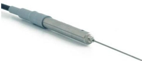
Figure 3 Accurate thermal needle TP08

Models TP07 and TP09 are more robust than TP02 or TP08; however, the attainable measurement accuracy is considerably lower.