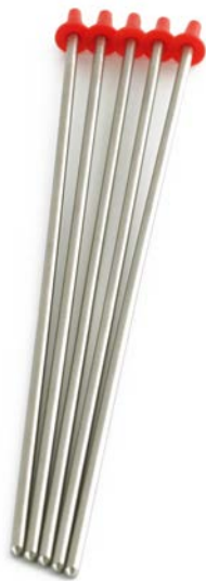
Figure 2 Guiding tubes for hard soils and dryout experiments