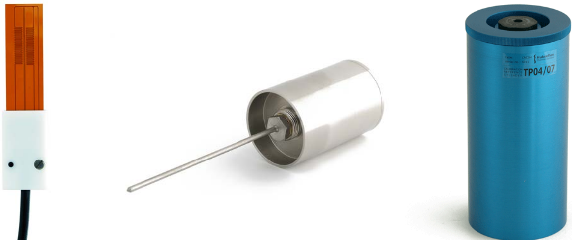
Figure 5 Foil type sensor model TP01, for long term monitoring, IT03 insertion tool with needle type TP07 (both part of MTN02) and CRC Calibration Reference Cylinder, offering a traceable reference material

Although in general the systems can be operated by following manuals and standards, we can provide you with expert training. Training vastly improves the level of service to the third party, the efficiency of working with the equipment and reduces the uncertainty of the end result.