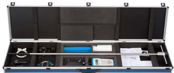
Figure 4 The complete and robust FTN02 measuring system including the 1.4 m long lance LN02