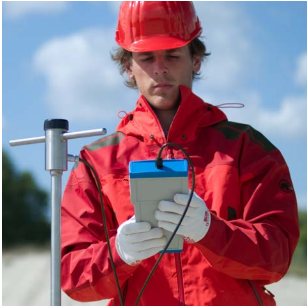
Figure 1 Soil thermal route survey with FTN02 including CRU02 control and readout unit

Hukseflux is a leading manufacturer of thermal conductivity / thermal resistivity measuring systems and sensors for use in soils. This brochure offers general guidelines for choosing the right system or sensor for your soil thermal conductivity measurement application.