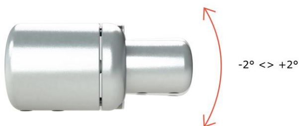
Figure 2 ALF01 albedometer levelling tool, can be rotated around the axis of the crossarm to which it is connected, and tilted over \pm 2^\circ .