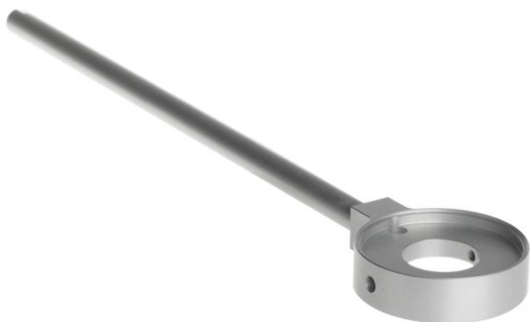
Figure 1 AMF02 or AMF03 albedometer kits are used to mount both an up- and a downfacing pyranometer, and construct an albedometer. The image shows the AMF02 mounting fixture and its rod. A glare screen for the downfacing sensor is also included.

Hukseflux offers a full range of dedicated, ready-to-use albedometers for measuring albedo. Alternatively, with the AMF03 or AMF02 mounting fixture in AMF / ALF series, you may choose to construct albedometers from popular Hukseflux pyranometers yourself. AMF03, AMF02 and SRA series albedometers can be levelled with ALF01 levelling fixture.