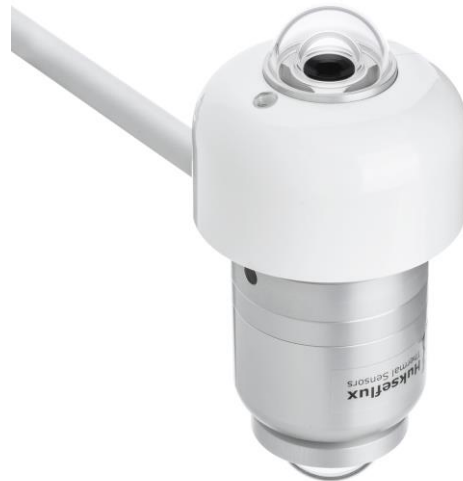
Figure 5 the end result using AMF03 and two SR30-D1 pyranometers: a state-of-the-art SRA30-D1 albedometer