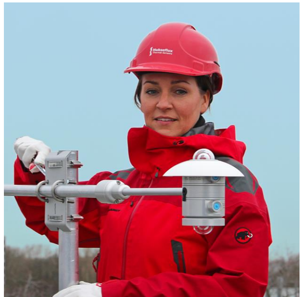
Figure 6 installation of AMF02 albedometer mounting kit and two SR20 pyranometers, mounted with ALF01 levelling fixture on a crossarm with crossarm bracket CMF01.