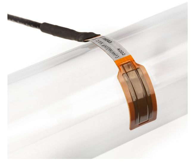
Figure 3 The flexible FHF03 being installed on a pipe