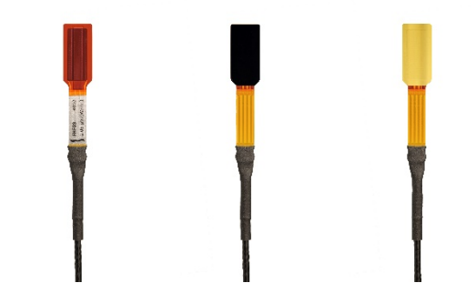
Figure 5 FHF03 with BLK-3015 and GLD-3015 stickers