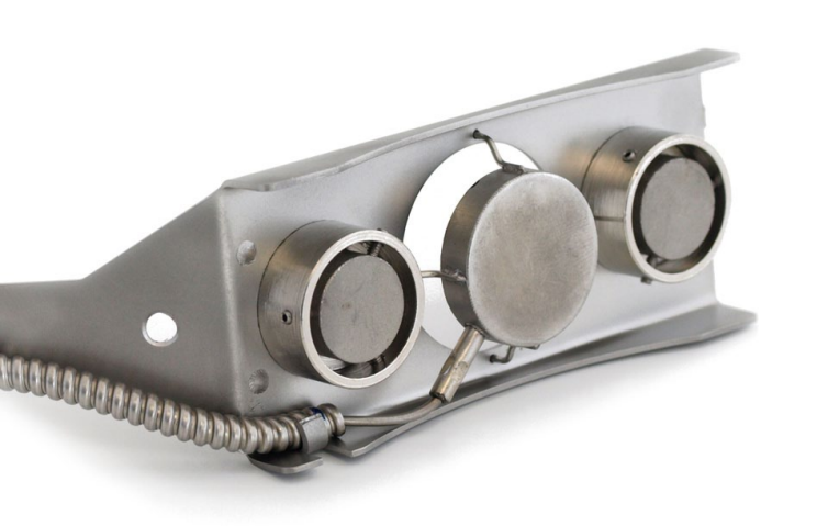
Figure 1 HF01 with frame with magnets

HF01 high temperature heat flux sensor measures heat flux and surface temperature at high temperatures, typically in industrial environments. It is particularly suitable for trend-monitoring and comparative testing. The same technology can be used to manufacture heat flux sensors for different applications.