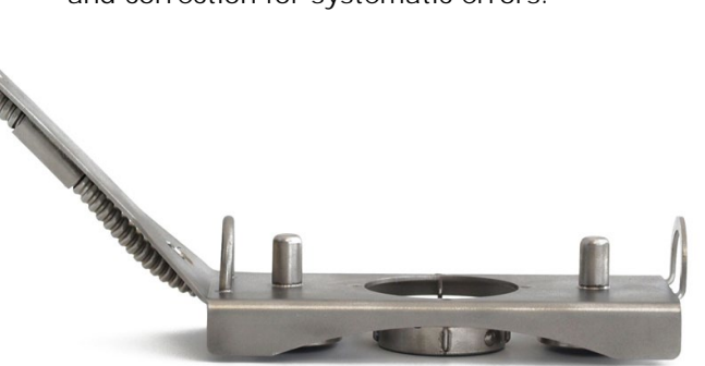
Figure 3 HF01 with frame with magnets

HF01 is most suitable for relative measurements using one sensor, i.e. monitoring of trends relative to a certain reference point in time or comparing heat flux at one location to the heat flux at another location. If the user wants to perform accurate absolute measurements with HF01, as opposed to relative measurements, the user must make his own uncertainty evaluation and correction for systematic errors.