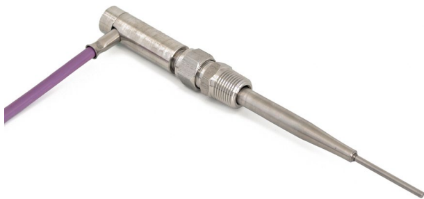
Figure 3 NF01, optional 4 \times 10^{-3} m diameter model, with screwed coupling