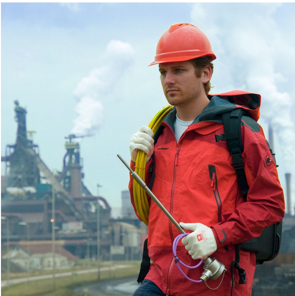
Figure 2 NF01: special design with positioning piece and connection head