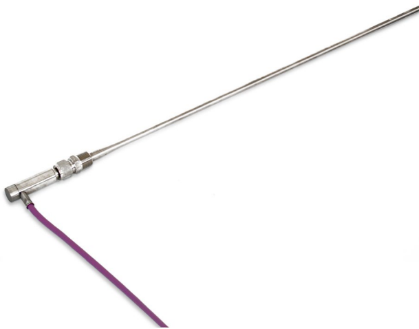
Figure 1 NF01, standard 8 \times 10^{-3} m diameter model, with screwed coupling

NF01 is used for monitoring heat flux and temperature in high temperature environments, typically in walls and shells of blast furnaces and smelters. Measuring heat flux as well as temperature with one sensor is more accurate and practical than using distributed temperature measurements. The same technology is used to manufacture heat flux sensors for different applications.