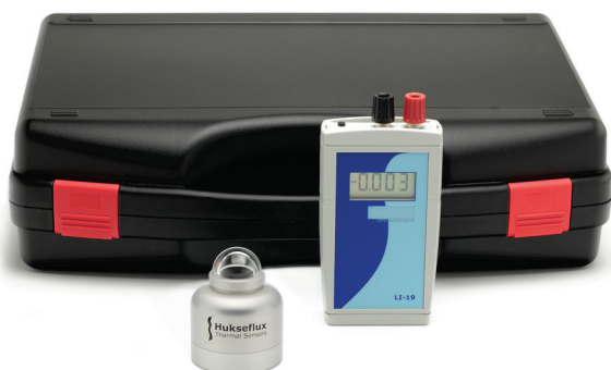
Figure 2 SR05-LI19 as it is delivered, in a practical transport case