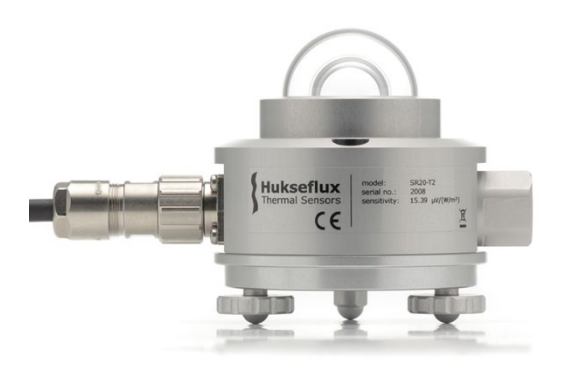
Figure 7 SR20 pyranometer with its sun screen removed

Whatever your application is, Hukseflux offers the highest accuracy in every class at the most attractive price level.