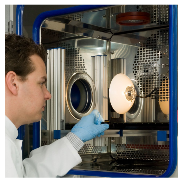
Figure 6 Temperature response testing at Hukseflux