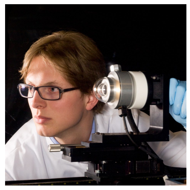
Figure 2 Directional response testing at Hukseflux