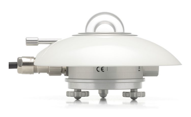
Figure 1 SR20 secondary standard pyranometer

Hukseflux invested more than 10 man-years in developing the infrastructure to manufacture, test and calibrate a secondary standard pyranometer. These efforts resulted in the SR20 secondary standard pyranometer, released February 2013.