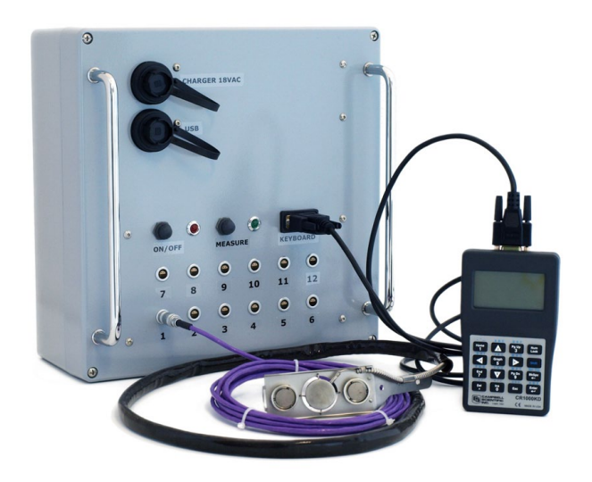
Figure 1 the ALUSYS measuring system, for trend monitoring and comparative surveys of heat flux and surface temperature in industrial environments. Connected to the MCU: one HF01 sensor, as well as the Keyboard Display.

ALUSYS is a measuring system for trend-monitoring and mobile survey of heat flux and surface temperature in industrial environments. Sensors and electronics have the robustness necessary for this application. Powered from a low-voltage rechargeable battery, it is easy and safe to use. In its standard configuration the system consists of an MCU Measurement Control Unit in a metal housing and 12 x heat flux and surface temperature sensors of model HF01. Measured data are stored for later analysis.