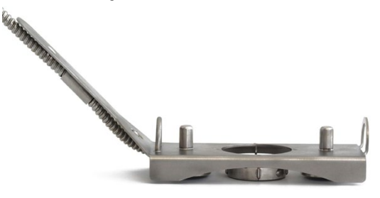
Figure 3 HF01 heat flux and surface temperature sensor with frame with magnets

HF01 heat flux sensor calibration is traceable to SI units. The factory calibration method follows the recommended practice of ASTM C1130. The recommended calibration interval of heat flux sensors is 2 years.